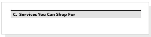
FIGURE 11: SERVICES YOU CAN SHOP FOR TABLE OF THE LOAN ESTIMATE

Services You Can Shop For are provided by persons other than the creditor or mortgage broker and are services that the consumer can shop for and will pay for at settlement. (§ 1026.37(f)(3)) Items listed as Services You Can Shop For must use terminology that describes each item and disclose them in alphabetical order. (§ 1026.37(f)(5))