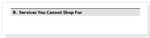
FIGURE 10: SERVICES YOU CANNOT SHOP FOR TABLE OF THE LOAN ESTIMATE

Services You Cannot Shop For are items provided by persons other than the creditor or mortgage broker that the consumer cannot shop for and will pay for at settlement. (§ 1026.37(f)(2)) Items listed as Services You Cannot Shop For must use terminology that describes each item, and disclose them in alphabetical order. (§ 1026.37(f)(5))